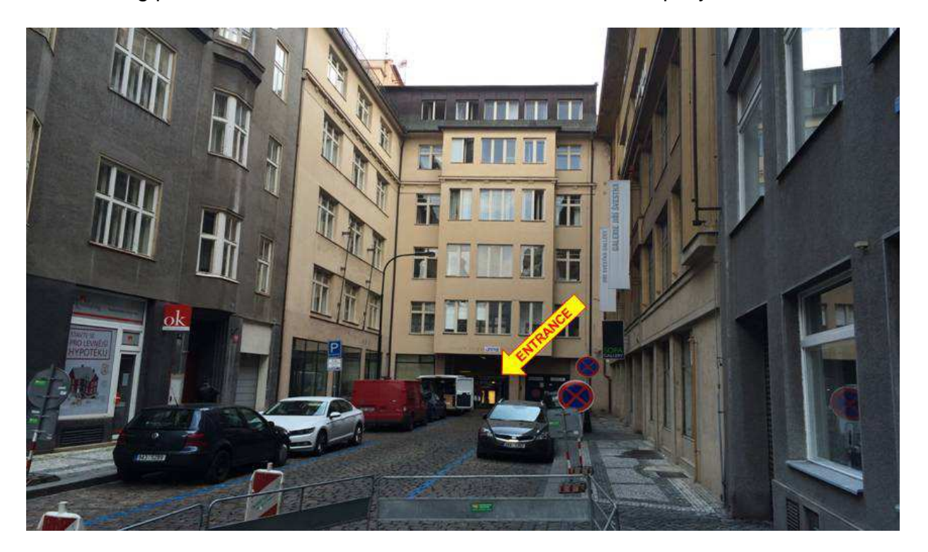
or from Těšnov through a passage

The meeting place can be accessed either from the street Biskupský dvůr